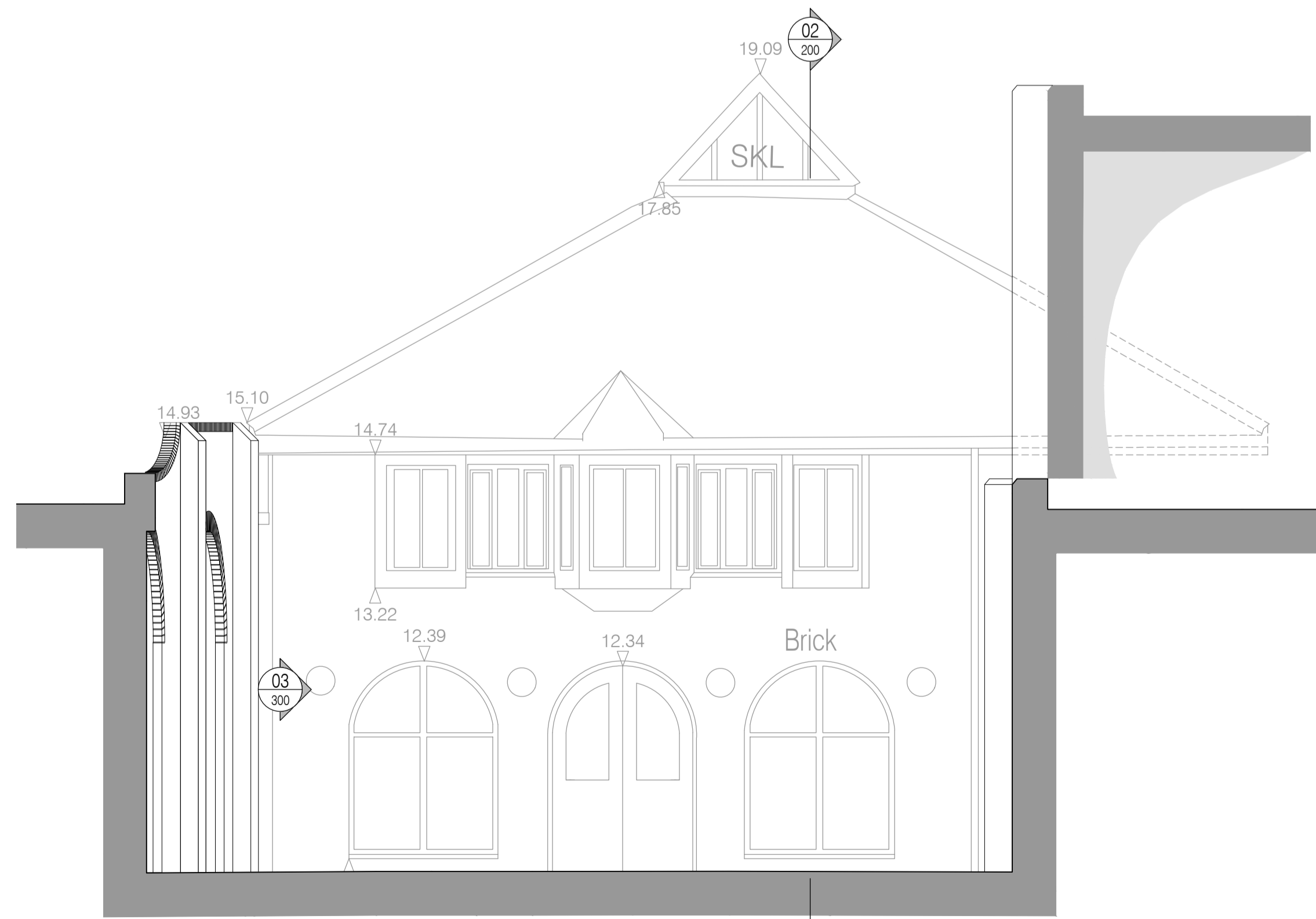
02 Section 01 Scale:1:50