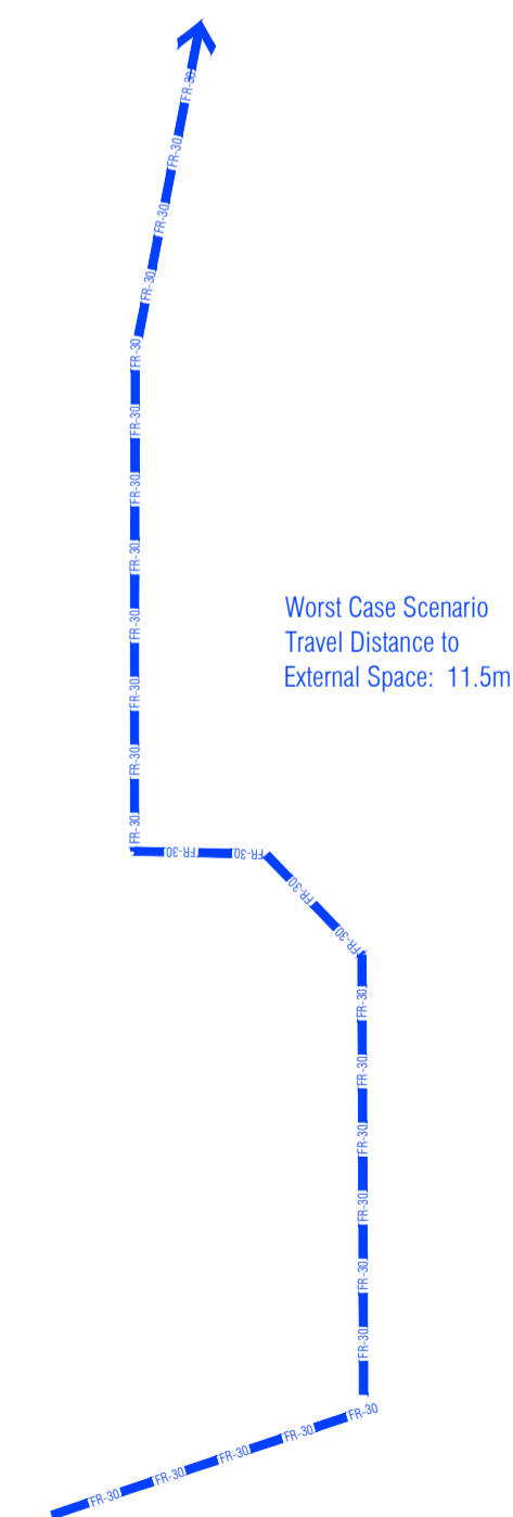
03 Total Travel Distance Plan - Type 3 - 2 Terrace Plots 5 - 6 Scale: 1:50

Opening Reference Legend Denotes opening type: Door, Window, Screen Denotes room number code Denotes floor level and unit/plot reference n° Denotes opening n°