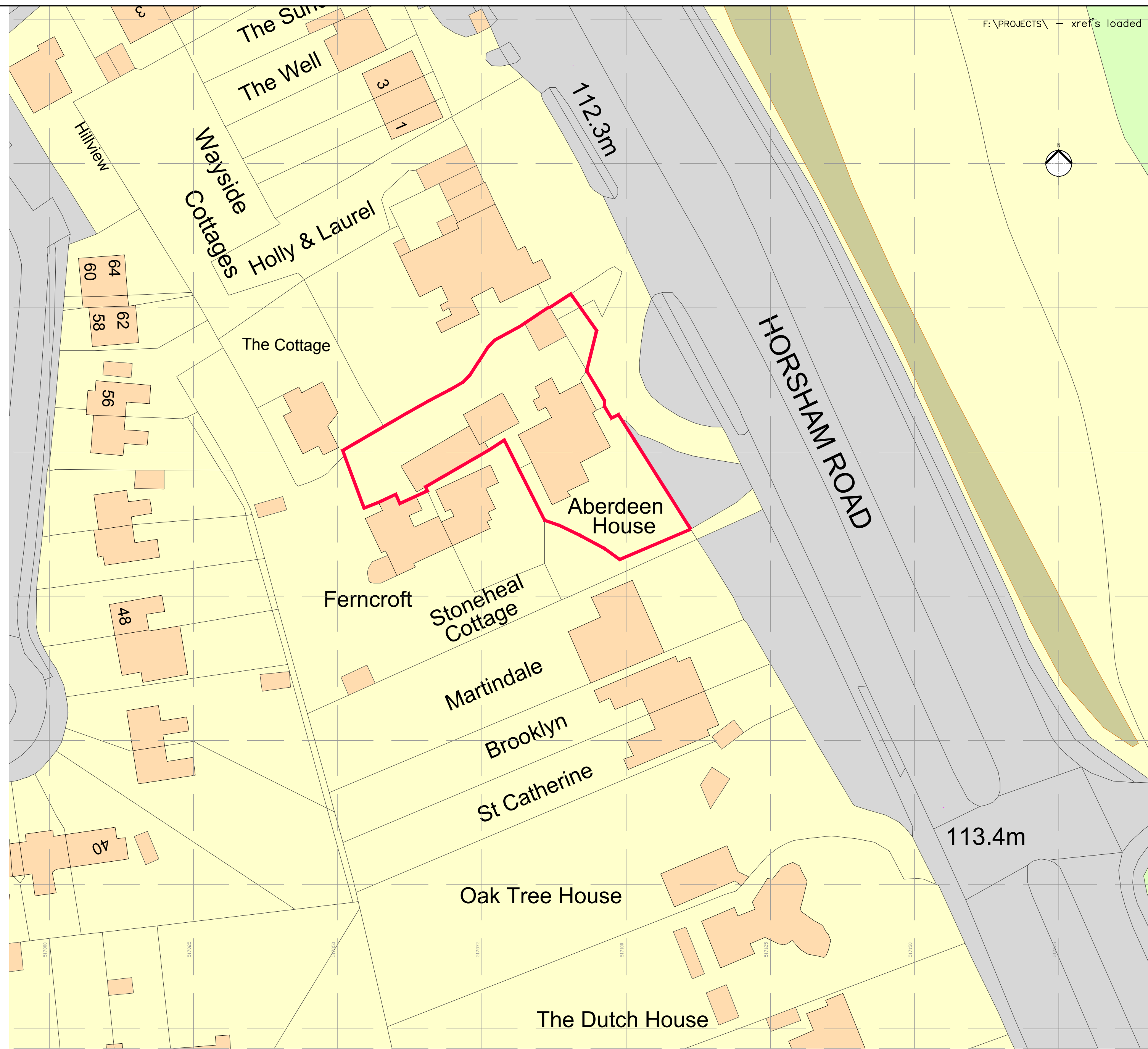
03 O. S. Site Plan Scale: 1:500