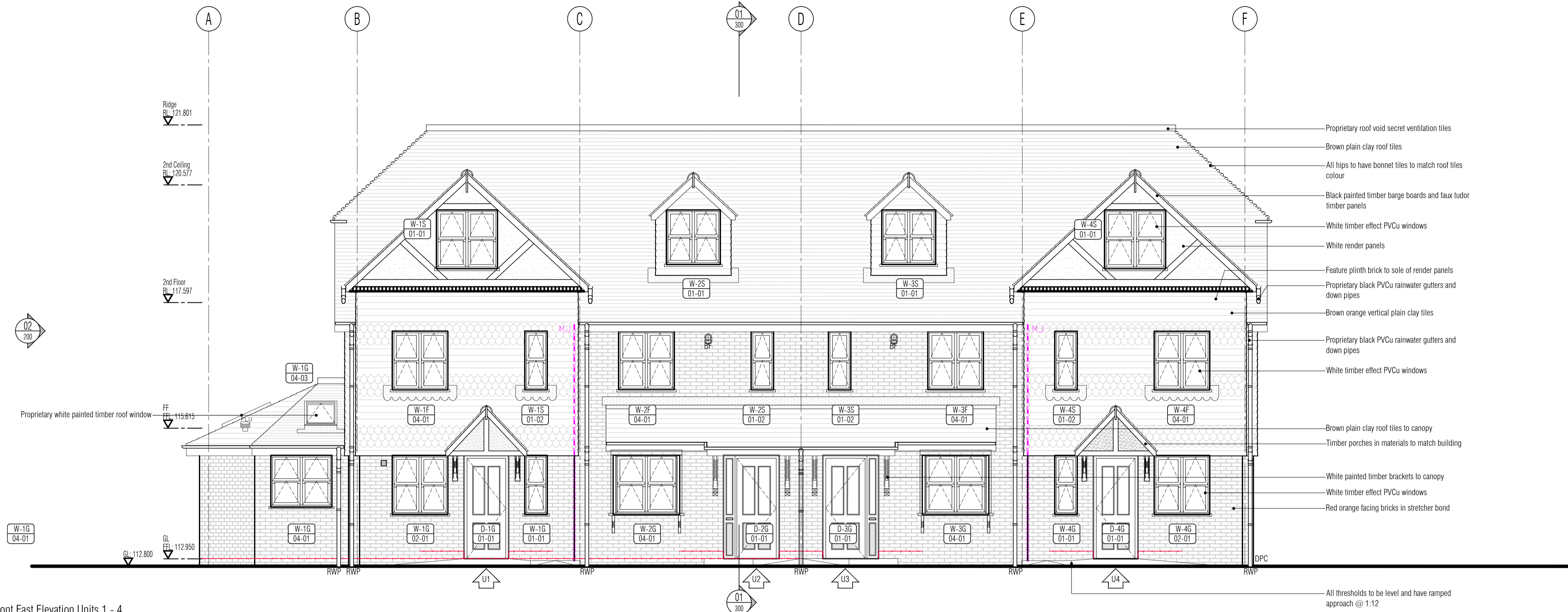
01 Front East Elevation Units 1 - 4 Scale: 1:50