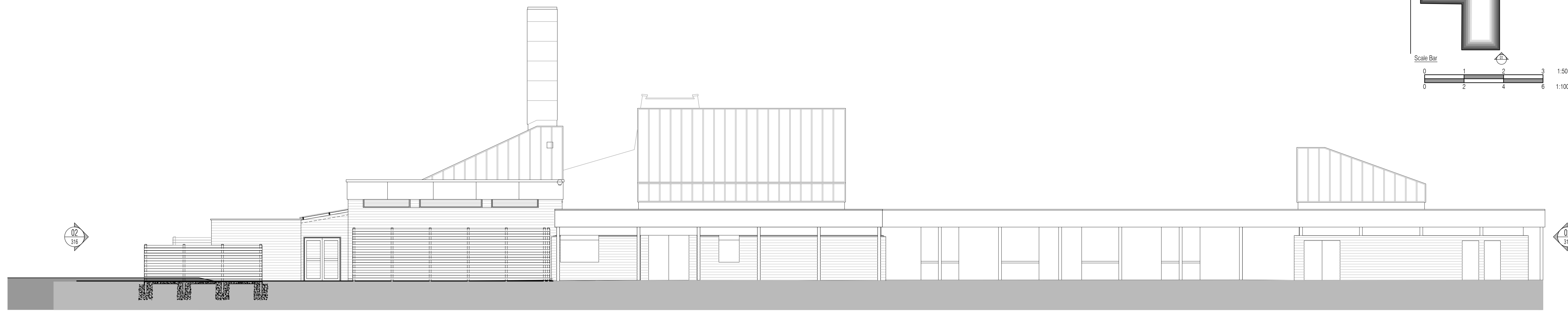
01 South Elevation Scale: 1:100