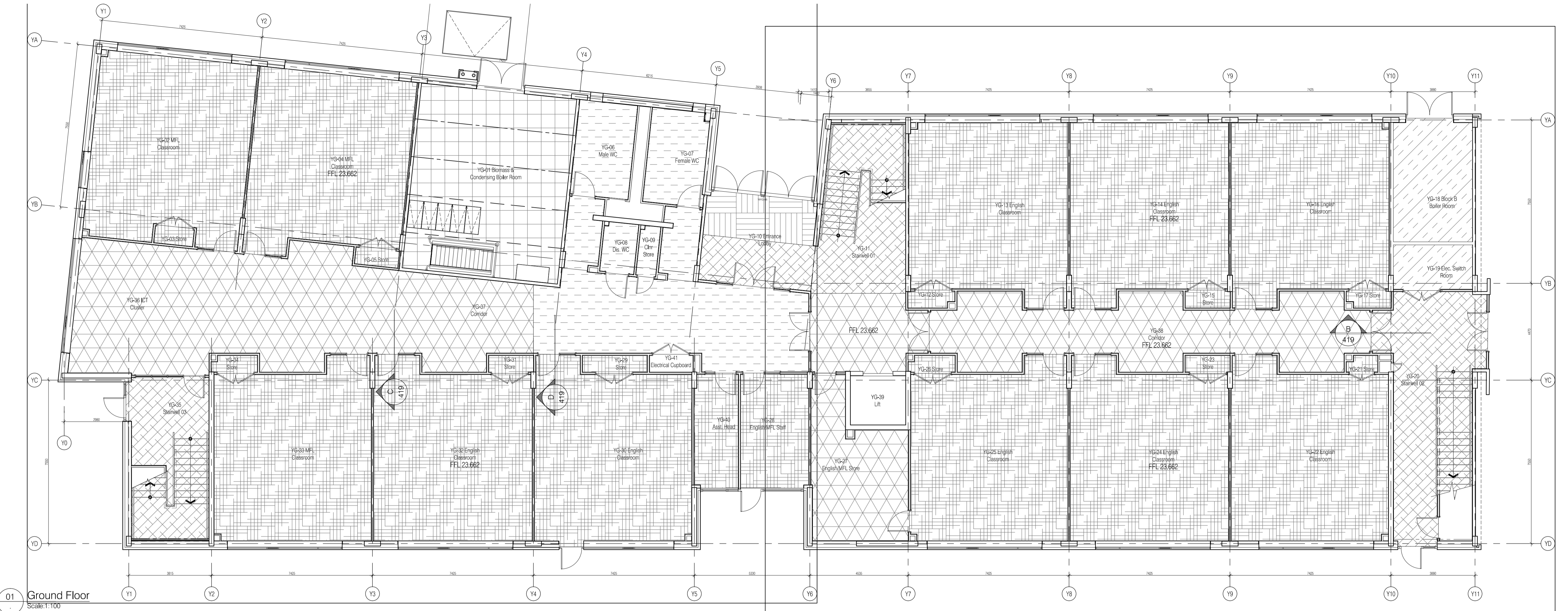
01 Ground Floor Scale: 1:100

NOTE: Flush thresholds are required throughout campus. Allow for reduced screed or lowered slab locally to accommodate varying depths of flooring. For floor transition details, refer to FCG drawing 222586-AY-119