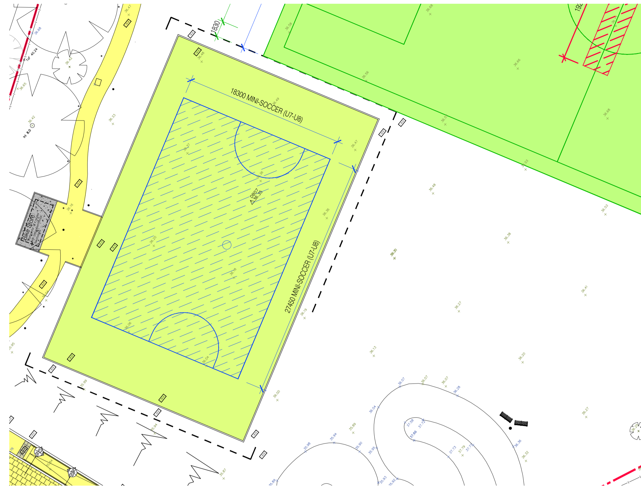
02 MUGA / Play Area: Mini-Soccer - Junior (U7-U8) Scale: 1:250